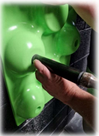
Check that all boards are properly secured