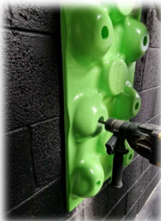
Use Appropriate Tools and safe work practice