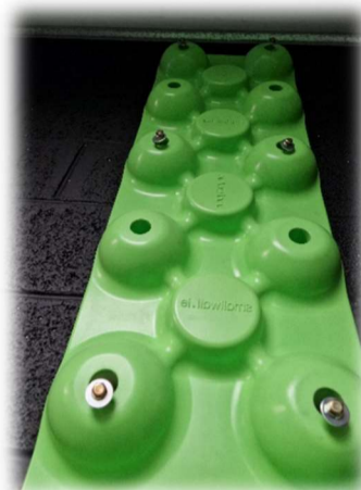
Use minimum 6 fixing points