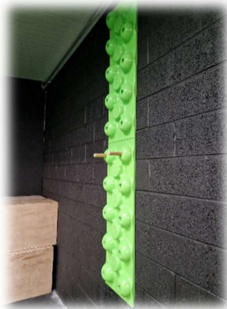
Plan your Layout to suit user / users