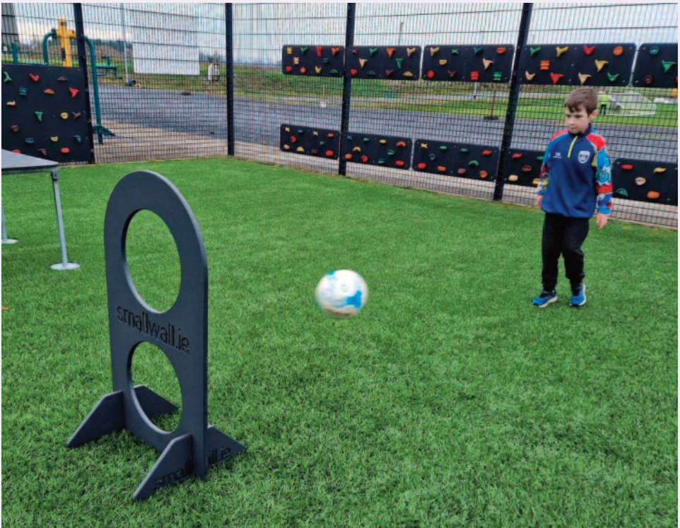
Double hole ground target