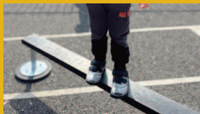
Senior Balance Board with Pads