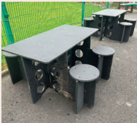
Senior Picnic Table Rectangular with Seats