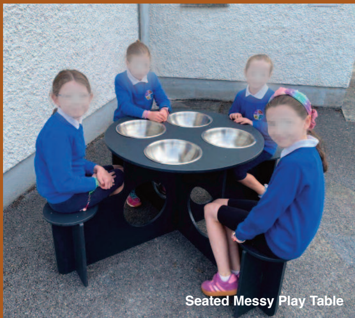
Seated Messy Play Table