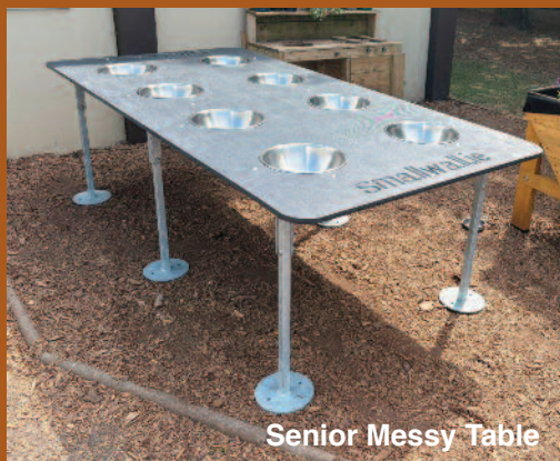
Senior Messy Table