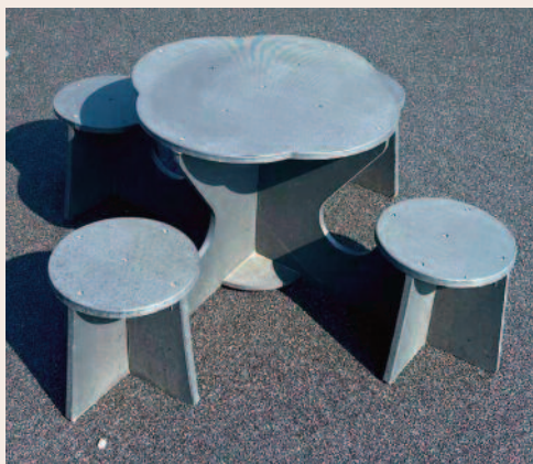
Junior Picnic Table Round with Seats