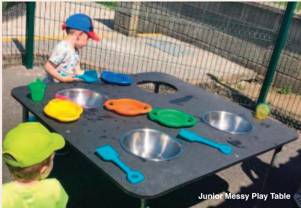
Junior Messy Play Table