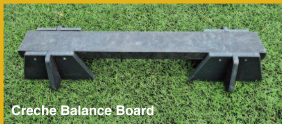
Creche Balance Board