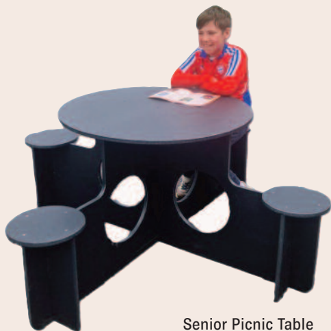
Senior Picnic Table Round with Seats

The Junior Picnic Table Round with Seats – The Senior Picnic Table Rectangular with Seats and the Senior Picnic Table Round with Seats (Suits adult size)